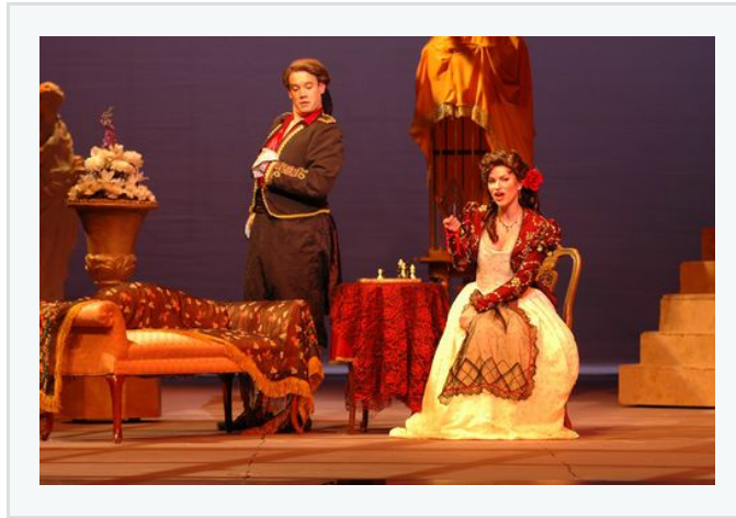
This picture shows a scene from an opera.

Imagine you are sitting in a theater. The curtain on the stage goes up. Music starts to play. A drama is acted out on the stage, with music playing the whole time. People sing and act out the story. When the show ends, the crowd claps as the singers bow.